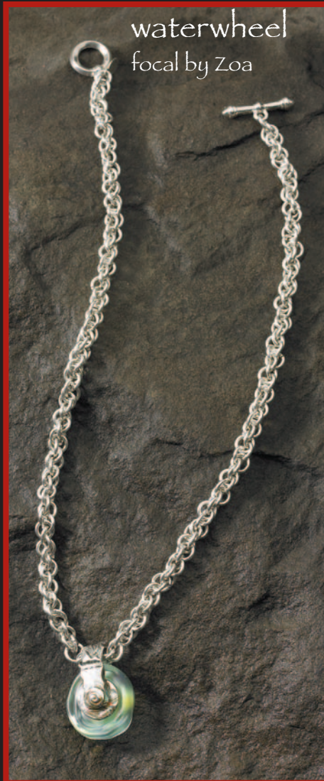
waterwheel focal by Zoa