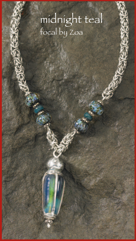
midnight teal focal by Zoa