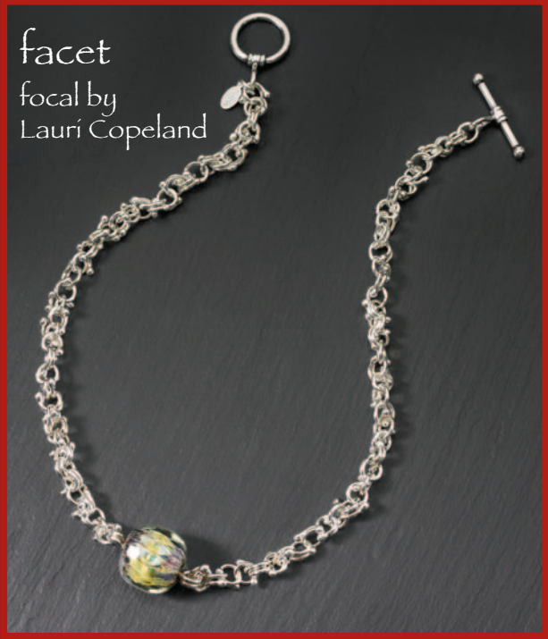
facet focal by Lauri Copeland