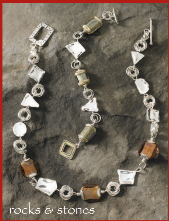
rocks & stones